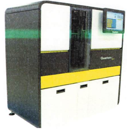
Data below represents results generated on the Simoa® HD-X Analyzer.