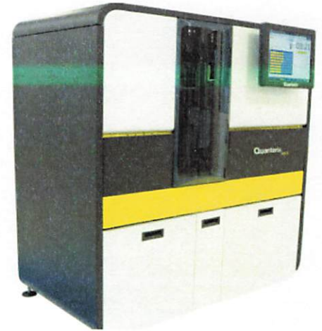
Data below represents results generated on the Simoa® HD-X Analyzer.