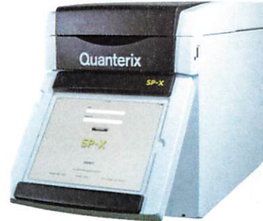
Data below represents results generated on the SP-X Imaging and Analysis System