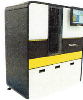
Data below represents results generated on the Simoa HD-X® Analyzer.