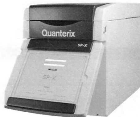
Data below represents results generated on the SP-X™ Imaging and Analysis System.