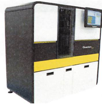
Data below represents results generated on the Simoa® HD-X Analyzer.