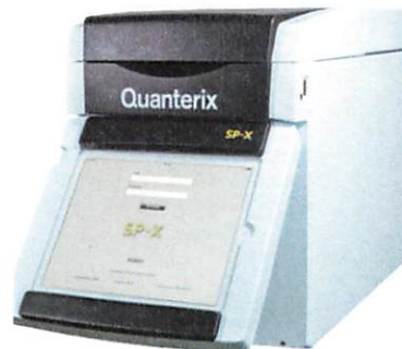
Data below represents results generated on the SP-X Imaging and Analysis System