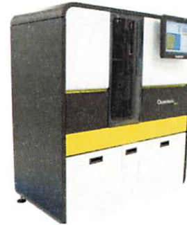
Data below represents results generated on the Simoa HD-X® Analyzer.