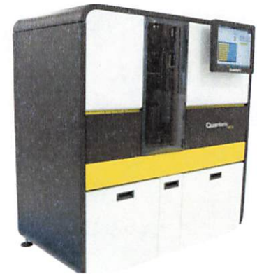
Data below represents results generated on the Simoa® HD-1 / HD-X & SR-X Analyzer.