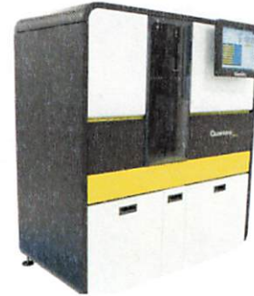
Data below represents results generated on the Simoa® HD-1 / HD-X Analyzer.