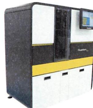
Data below represents results generated on the Simoa® HD-X Analyzer.