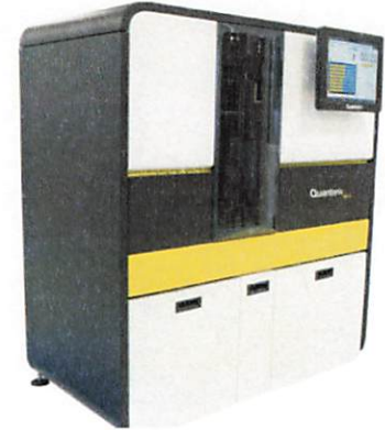
Data below represents results generated on the Simoa® HD-X Analyzer.

1 RGP / SBG Diluent (SR-X) are not Kit Lot Specific