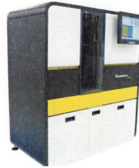
Data below represents results generated on the Simoa HD-X® Analyzer.