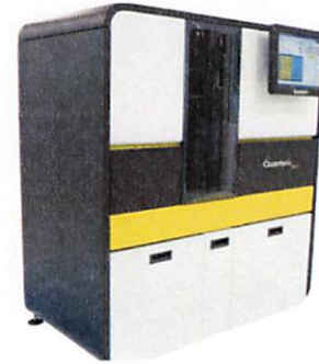
Data below represents results generated on the Simoa HD-X® Analyzer.