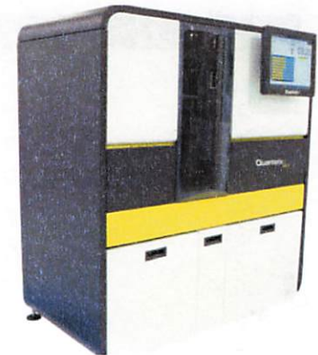
Data below represents results generated on the Simoa® HD-X Analyzer.