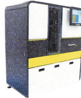
Data below represents results generated on the Simoa HD-X® Analyzer.