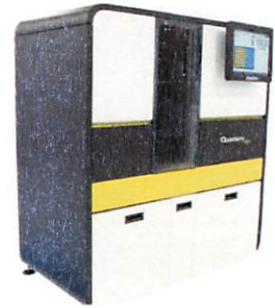
Data below represents results generated on the Simoa® HD-X Analyzer.