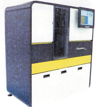
Data below represents results generated on the Simoa® HD-X Analyzer.

† Specific for use on the SR-X platform - refer to the Simoa® Neuro 2-Plex B SR-X Kit Instructions (KI-0062).