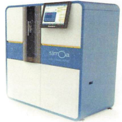
Data below represents results generated on the Simoa® HD-1 Analyzer.