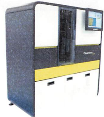
Data below represents results generated on the Simoa® HD-X Analyzer.

1 RGP / SBG Diluent (SR-X) are not Kit Lot Specific