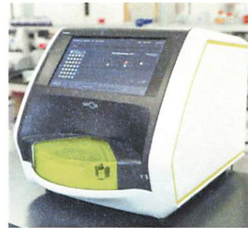
Data below represents results generated on the Quanterix SR-X® Ultra-Sensitive Biomarker Detection System