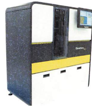
Data below represents results generated on the Simoa HD-X® Analyzer.