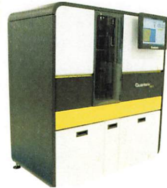
Data below represents results generated on the Simoa® HD-X Analyzer.