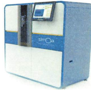
Data below represents results generated on the Simoa HD-1® Analyzer.