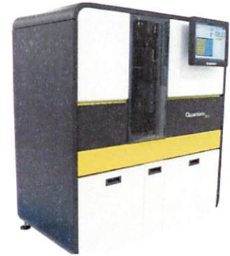
Data below represents results generated on the Simoa® HD-X Analyzer.