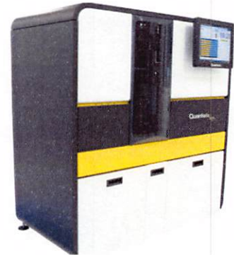
Data below represents results generated on the Simoa® HD-X Analyzer.