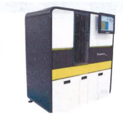
Data below represents results generated on the Simoa® HD-X Analyzer.