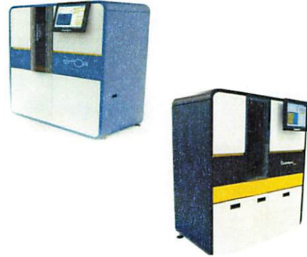
Data below represents results generated on the Simoa HD-1® / HD-X® Analyzer.