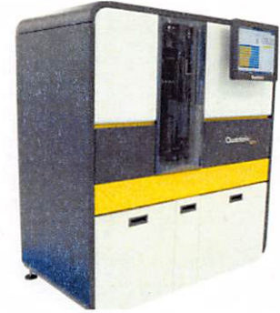
Data below represents results generated on the Simoa® HD-X