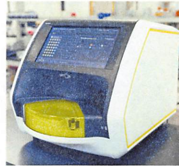
Data below represents results generated on the Quanterix SR-X® Ultra-Sensitive Biomarker Detection System