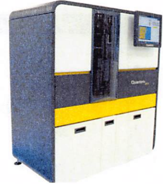
Data below represents results generated on the Simoa™ HD-X Analyzer.