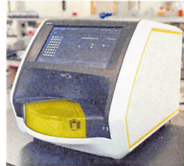
Data below represents results generated on the Quanterix SR-X™ Ultra-Sensitive