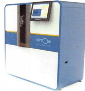
Data below represents results generated on the Simoa HD-1® Analyzer.