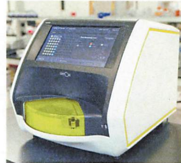
Data below represents results generated on the Quanterix SR-X™ Ultra-Sensitive