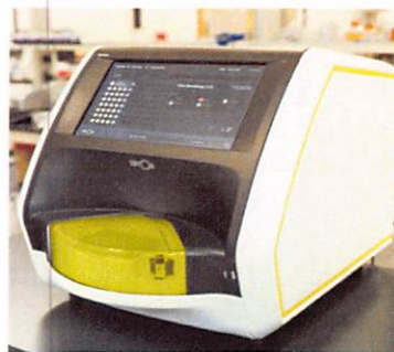
Data below represents results generated on the Quanterix SR-X™ Ultra-Sensitive