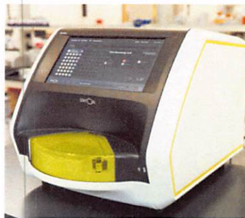
Data below represents results generated on the Quanterix SR-X™ Ultra-Sensitive