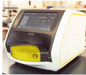
Data below represents results generated on the Quanterix SR-X™ Ultra-Sensitive