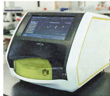
Data below represents results generated on the Quanterix SR-X™ Ultra-Sensitive