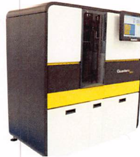
Data below represents results generated on the Simoa HD-X® Analyzer.