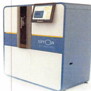
Data below represents results generated on the Simoa HD-1® Analyzer.