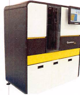
Data below represents results generated on the Simoa HD-X® Analyzer.