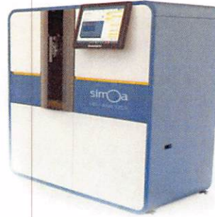
Data below represents results generated on the Simoa HD-1® Analyzer.