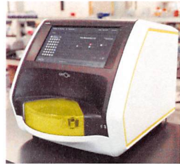
Data below represents results generated on the Quanterix SR-X™ Ultra-Sensitive