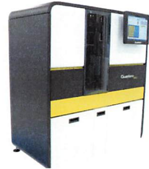
Data below represents results generated on the Simoa™ HD-X Analyzer.