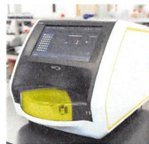
Data below represents results generated on the Quanterix SR-X™ Ultra-Sensitive Biomarker Detection System