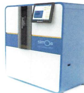
Data below represents results generated on the Simoa™ HD-1 Analyzer.