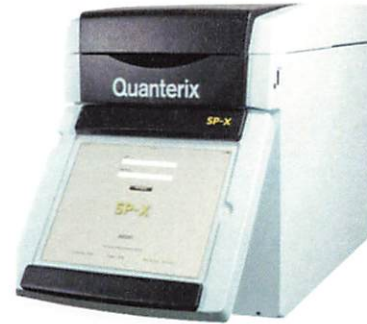
Data below represents results generated on the SP-X Imaging and