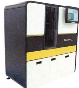
Data below represents results generated on the Simoa™ HD-X Analyzer.