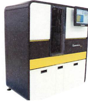
Data below represents results generated on the Simoa™ HD-X Analyzer.