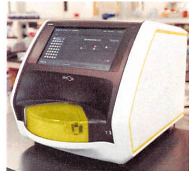
Data below represents results generated on the Quanterix SR-X™ Ultra-Sensitive